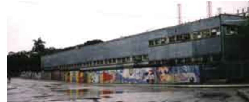
above left and middle: Mural in Pinar del Rio above right and below: Mural in Regla, Havana

Although both countries are separated by the Spanish and Portuguese languages, there are deep connections between Cuba and Brazil. Historically these date back to the earliest beginnings of colonization and traffic in human beings. Into the second half of the 19th century Cuba, Brazil beside North America were the main customers for slaves from Africa. Many cultural roots of Cuban and Brazilian culture, in music, art and last but not least religion grew on this commercial route. Today the exchange of this two countries is mostly limited on a political level. With the project CUBABRASIL we want to rediscover and animate this cultural interaction in the range of contemporary art. The European perspective is represented by German artists, who interact within this Latin American environment.